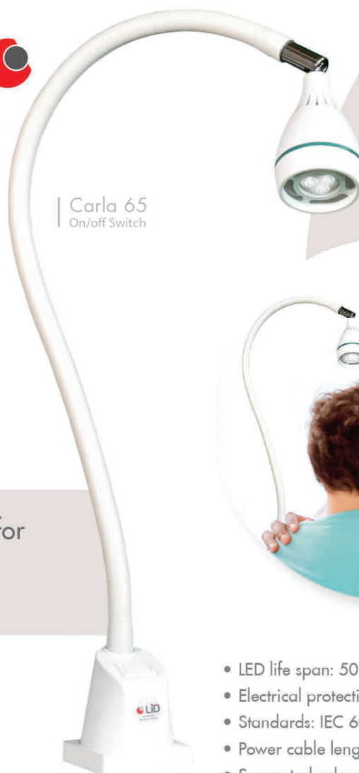
Carla 65 On/off Switch

Ideal as an examination lamp for nurses use, or for any medical speciality and general practice